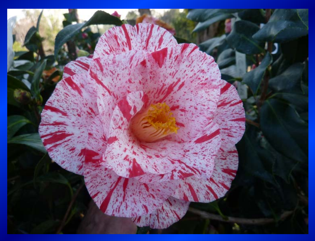
C. Japonica 'Betty Foy Sanders'

SEMIDOUBLE – Two or more rows of large regular, irregular or loose petals nine or more very prominent stamens, sometimes with petaloids. The petals may overlap or be in rows Sometimes blooms can have a concave center