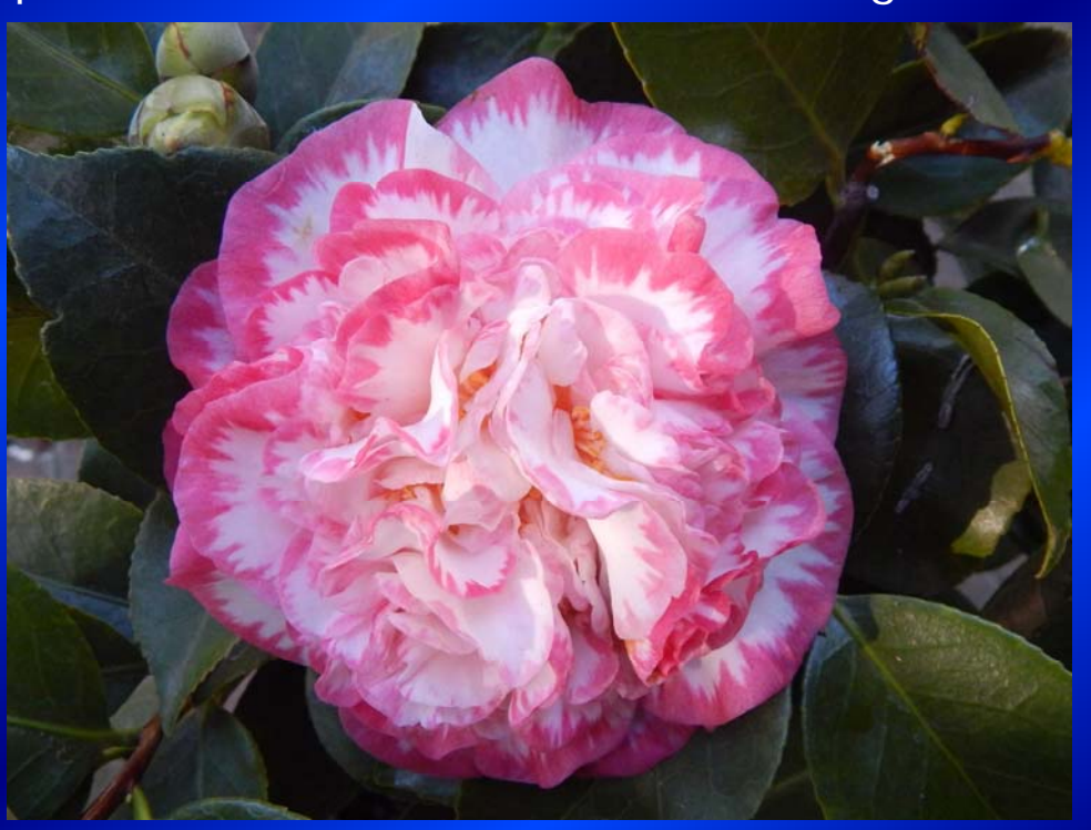
C. Japonica 'Margaret Davis'

Full Peony Form – Convex mass of mixed irregular petals, petaloids and stamens never showing stamens.