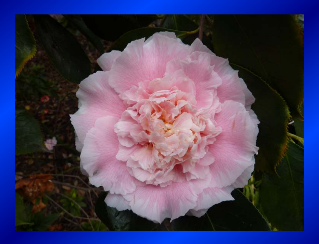
C. Japonica 'Elegans Splendor'

ANEMONE FORM – One or more rows of large outer lying flat or undulating; the center of a convex mass of intermingled petaloids and stamens.