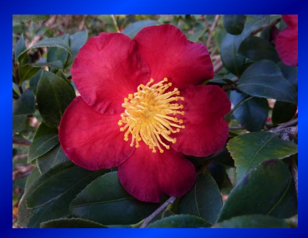
C. Sasanqua 'Yuletide'

SINGLE – One row of not over eight regular, irregular Or loose petals and conspicuous stamens.