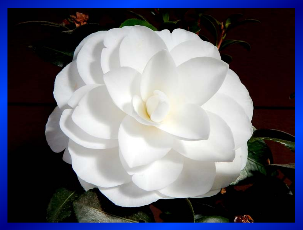
C. Japonica 'Nuccio's Gem'

FORMAL DOUBLE – Fully imbricated, many rows of petals, never showing stamens.