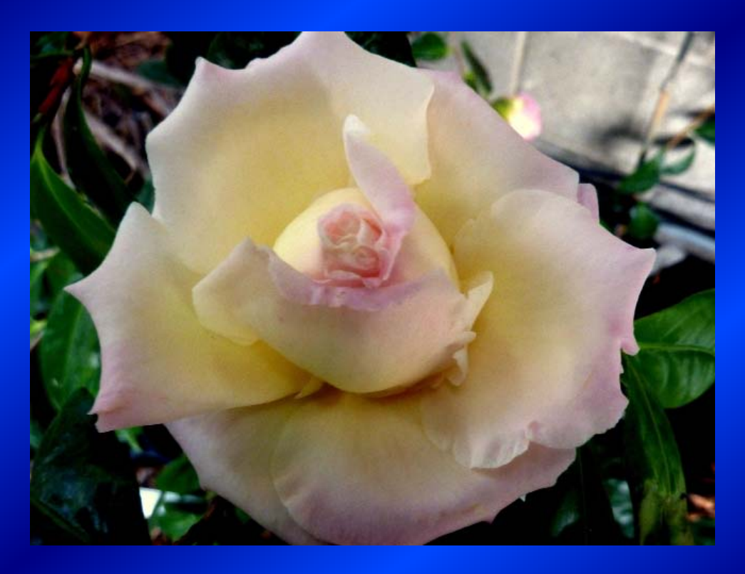
C. Hybrid 'Senritsu-ko'

ROSE FORM DOUBLE – Layers of petals appearing as a rose bud in early stage maturing to an open bud showing stamens in a concave center.